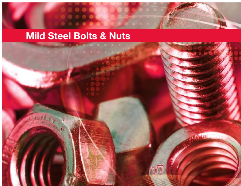
Mild Steel Bolts & Nuts