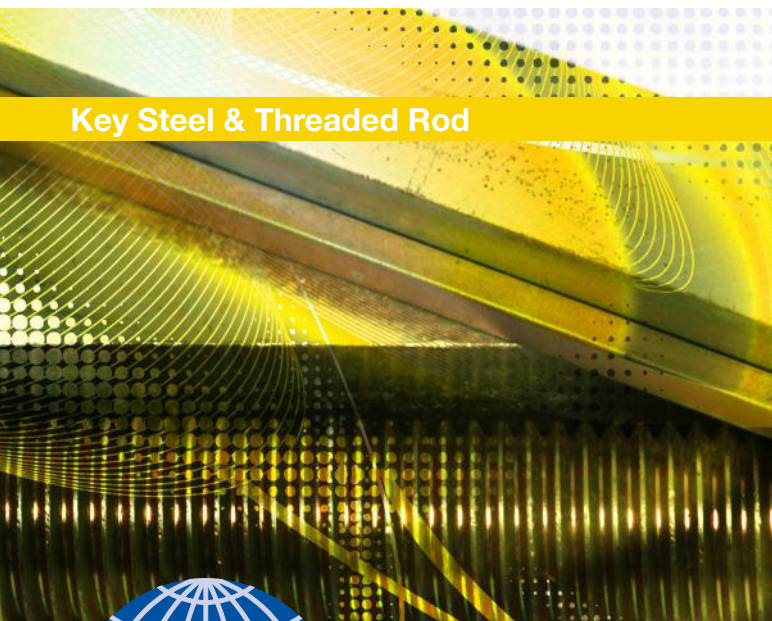
Key Steel & Threaded Rod