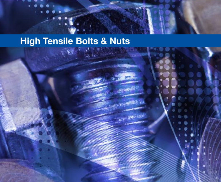
High Tensile Bolts & Nuts