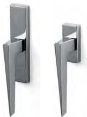
C218S - fixed window slider