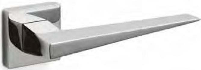
Denver - M218