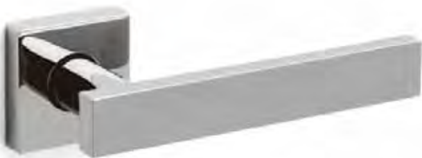
Blade - M213