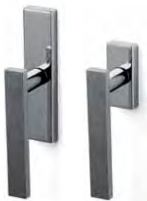
C213S - fixed window slider