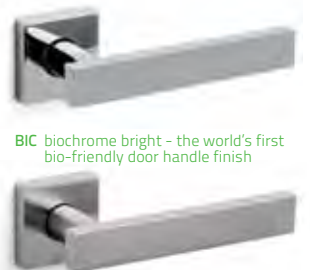
BIC biochrome bright - the world's first bio-friendly door handle finish