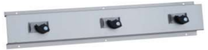
*ML981_3 image shown