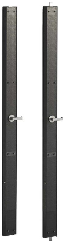
Model DV 2 Point Vertical Lock