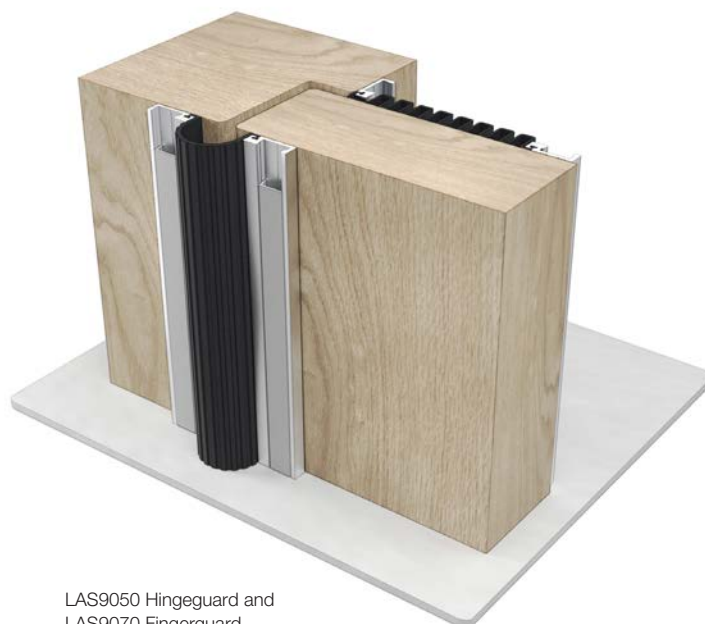
LAS9050 Hingeguard and LAS9070 Fingerguard