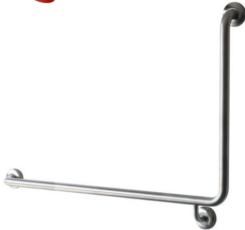
*Left Handing image shown above and below.