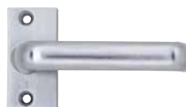
SP3540-L2 90° Lever (pictured, suits right hand door) SP3540-L3 (suits left hand door)