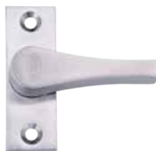
SP3540-T1 Escape Turn

These variations interact directly with the hub mechanism on the lock via a lock spindle (included). Lever variations comply with the requirements of AS1428.1.