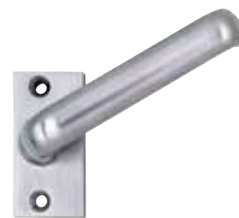
SP3540-L1 45° Lever