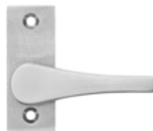
SP3540-T2 Teardrop Turn

These variations interact with the cylinder mechanism of the lock either directly or via a turnsnib adaptor (included).