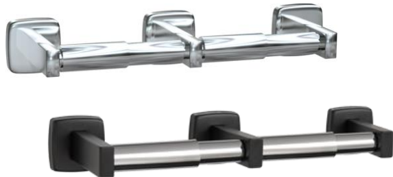
Models shown: 10-7305-2B (bright finish) & 10-7305-2-41 (matte black finish)