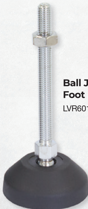
Ball Jointed Foot