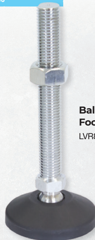
Ball Jointed Foot