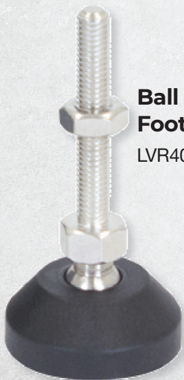
Ball Jointed Foot

For stainless steel option add SS to the part number, eg. LVR400850SSS