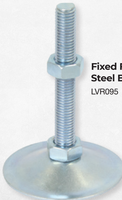
Fixed Foot Steel Base LVR095