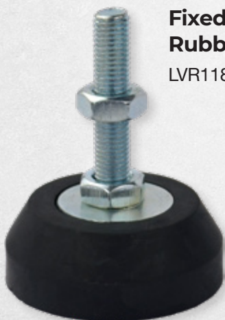
Fixed Foot Rubber Base LVR118