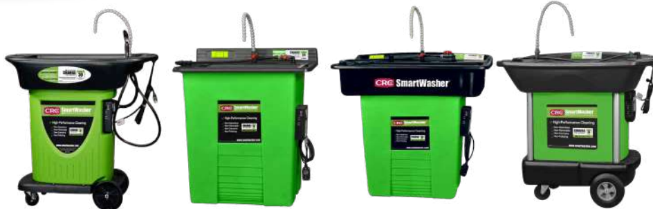
SW-23 Mobile Parts/Brake Washer