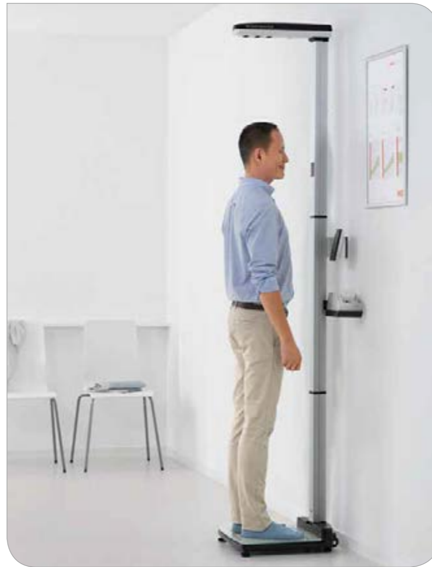
The measurement: Weight, height, and BMI are measured in seconds while the patient is standing straight and still. The patient can step off of the measuring station.