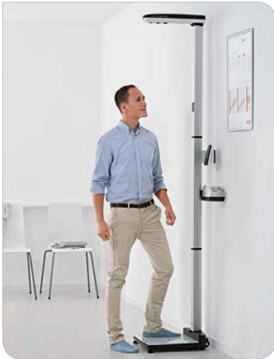
The starting point: The measuring process automatically starts when the patient steps on the measuring station.