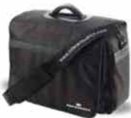
The soft carrying case