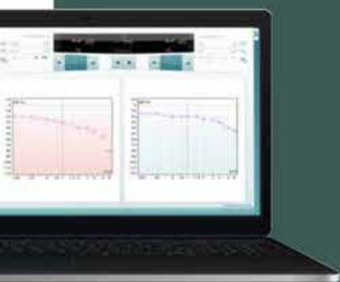
Diagnostic suite software (AS608e only)