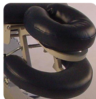
5105: Prone Arm Rest - Massage