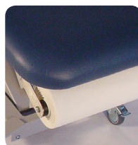
6017: Paper Towel Roll Holder