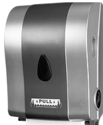
300 Paper Towels