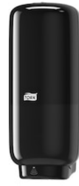
Tork Skincare Disp -Intuition sensor BI 561608