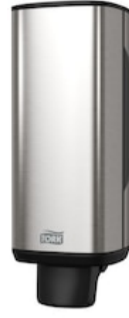
Tork Skincare Dispenser 460010