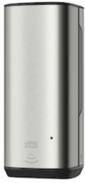
Tork Skincare Dispenser-Intuition sensor 460009