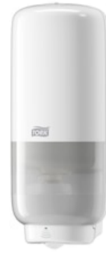
Tork Skincare Disp -Intuition sensor Wh 561600