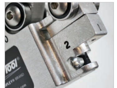
Equipped with four speed positions to optimize performance.