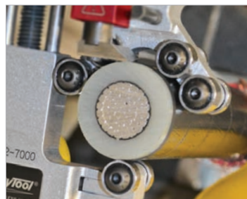
Extra rollers provide tool stability on a range of cable sizes.