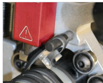
Winding pin keeps semi-con strip from getting in the way.