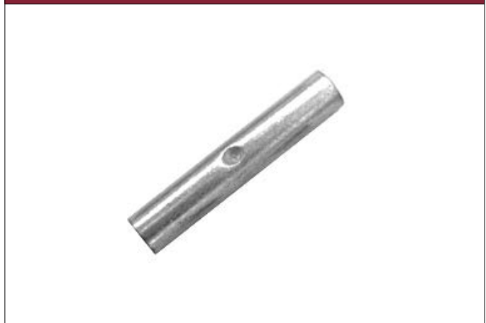
TCLK Tinned Copper Links

IEC 61238-1:2003. AS/NZS 4325.1:1995 Available on request