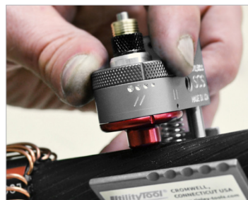
Four blade pitch settings adjust the spiral width for various cable sizes.