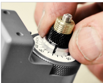
Blade depth is easily adjustable & set by turning the dial.