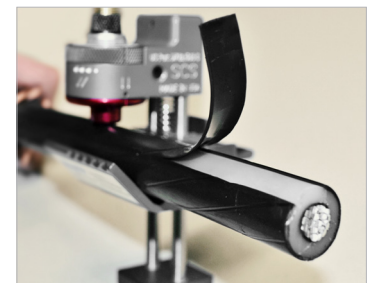
Simply pull the tool along the full cable length to perform longitudinal cuts.