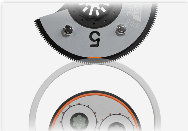
Fixed depth saw to avoid cable damage