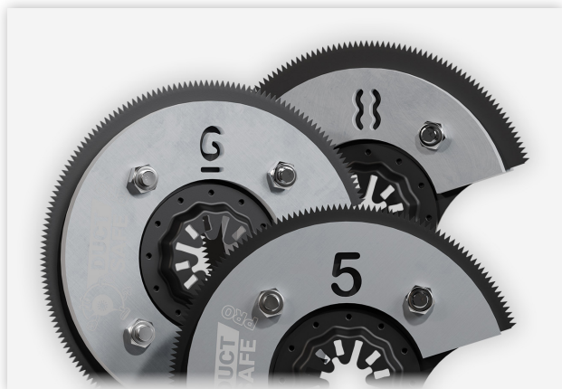
Saw depth clearly labeled for fast selection