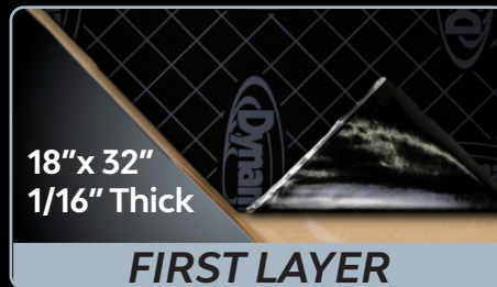
18"x 32" 1/16" Thick

12 Sq.Ft. Dynamat® Xtreme® (3 Sheets 18"x32" each) Vibrational Damping Material