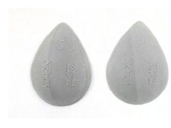
MET PADS 774 Non-Adhesive pack 10 pairs $6.38

POLY-U from the USA - Compare to Poron/PPT