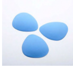
MET DOMES Non-Adhesive $30.40

Quality German Moss Rubber 15% discount!