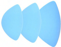
ARCH PADS Adhesive backed $46.55

Poron Components are supplied in packs of 12 pairs Compare the value! 5% discount!