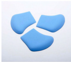
MET BARS Non-Adhesive $33.25