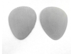
MET PADS 764 Non-Adhesive L & R - pack 10 pairs $6.38

Quality German Moss Rubber 15% discount!