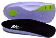
Low Density Purple 3/4 or full-length