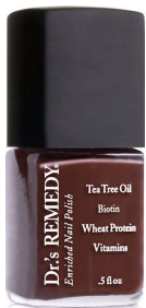
DESIRE Dark Brown