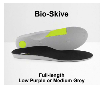
Full-length Low Purple or Medium Grey

BIO-ADVANCED are superior EVA insoles and are available in 3/4 or full-length in low, medium and high densities. Bio-Advanced offer excellent biomechanical control and are easily modified chairside. Each pair is supplied with FREE self-adhesive components for adjusting heel lift/wedge and mpj. Heat mouldable and supplied with a hard-wearing black cover.