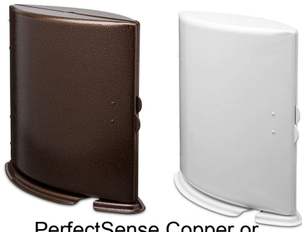
PerfectSense Copper or White Heating Chamber

We continue to live with the pandemic so we focus even more on safety & hygiene in our workplace.