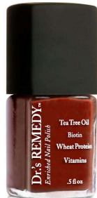
RELIABLE Rustic Red