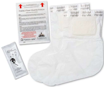
PerfectSense Sealed Paraffin Filled Booties