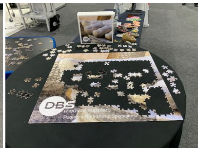
Day 2 - Working Through It