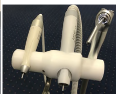
Spray, Vac & Syringe

NSK 40K rpm Silent Vacuum and 40K rpm Spray Handpieces plus Air/Water Syringe. Internal Vacuum Motor & Compressor Digital Touch Screen Display, 5 Soft Close Drawers + Storage Durable, Hygienic, Easy Clean Surface, Mag Lamp Bracket