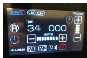
Touch Screen Controls