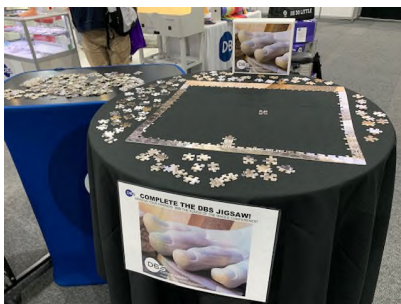
Day 1 - Just Started