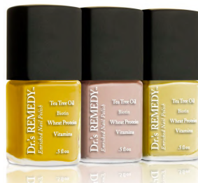
Tactful Turmeric, Sweet Soleil Pleasing Pale Peach

REMEDY SUMMER SPECIAL! 10% OFF EVERYTHING THRU DECEMBER