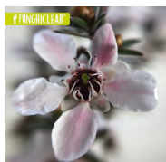
Manuka oil is one of the active ingredients

Natural anti-Fungal Nail & Foot Spray with Manuka oil and other botanicals