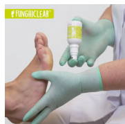
Upside down spray makes it easy to use by patients or for clinic dispensing

The natural active ingredients make it difficult for fungi to survive. It helps improve the health and comfort of feet throughout the year. Clever "Upside Down" spray mechanism. Makes it easy to apply for patients who can't reach their feet easily and great for in clinic dispensing. Safe to use as an adjunct to other clinic fungal treatments such as laser. Patients find it simple to use as part of an anti-fungal hygiene program. Full anti-fungal protection. Can be applied to toenails, feet and inside shoes. Buy in bulk and save. RRP of $35.65 generates excellent clinic income.