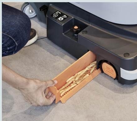
Easy access to emptying and cleaning the debris tray