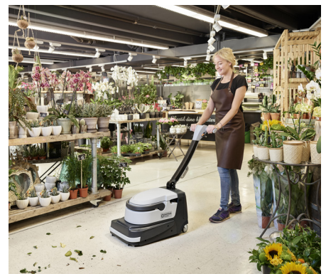
Cleaning floors with ease and speed - sweep, scrub and dry at the same time