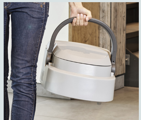
Tank-in-tank design for easy handling when emptying and refilling