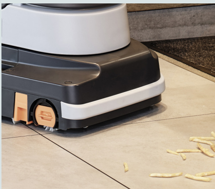
Easy pick-up of larger debris as front squeegee can be lifted