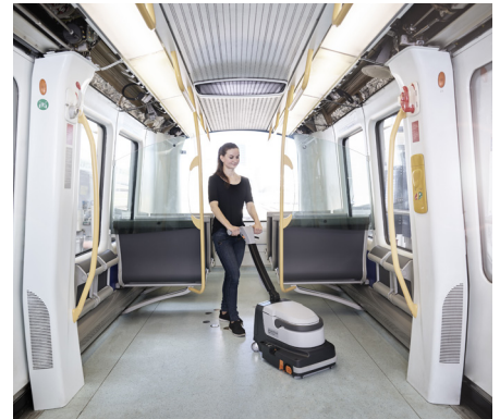
Easy to maneuver thanks to its pivoting wheels and the ergonomic adjustable handle