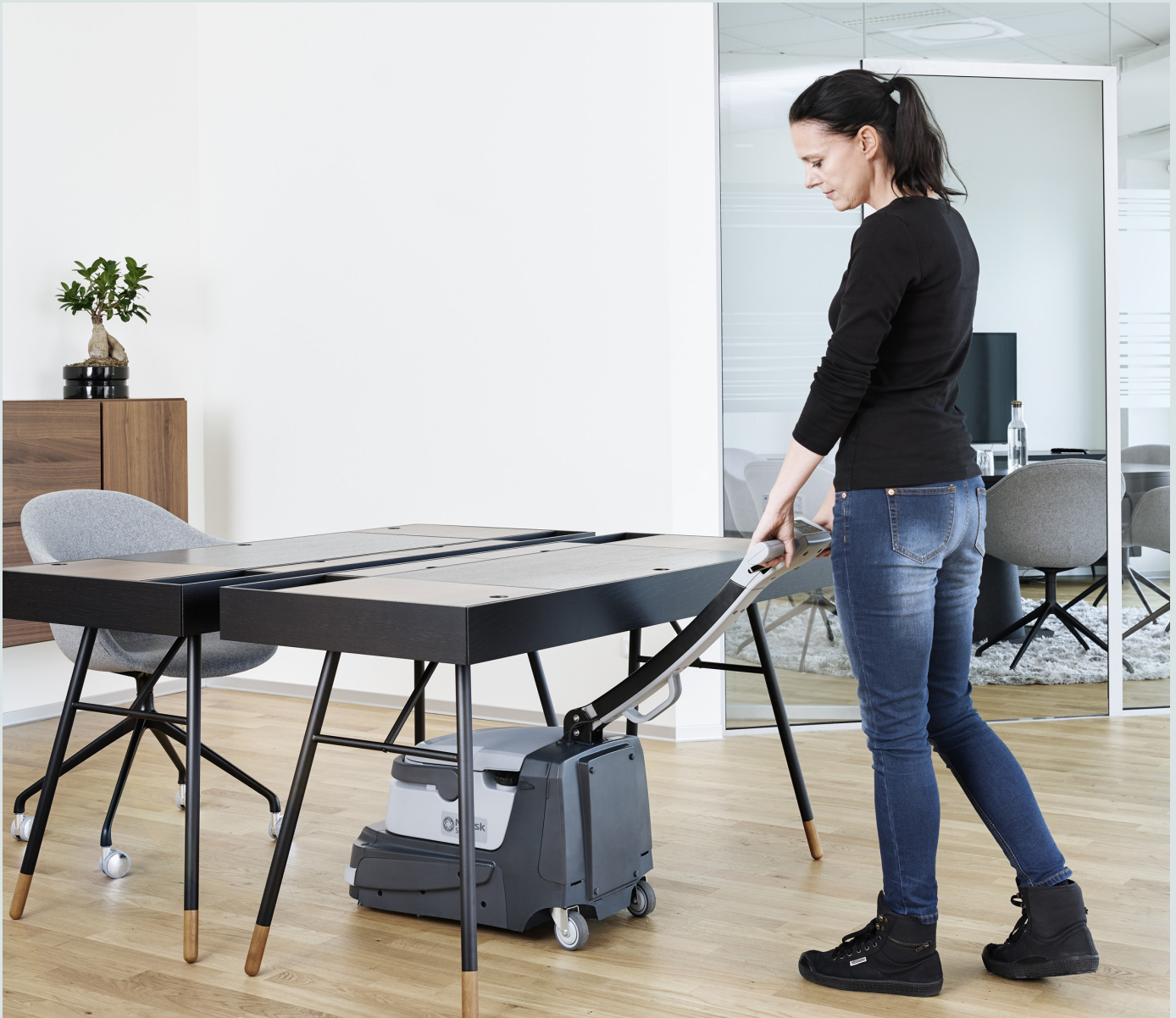
The adjustable handle which can be fixed when cleaning larger areas and unlocked when you are cleaning under furniture and shelves