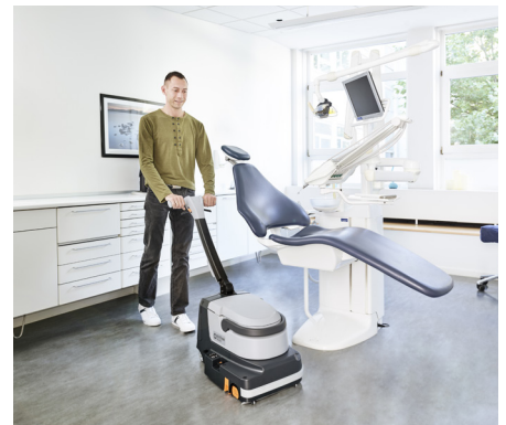
In-depth performance to fully meet the hygiene standards of clinics and hospitals