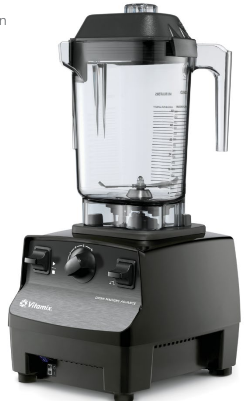
VM10198 - Black pictured