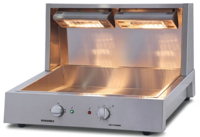
MW10CW - Chip Warmer