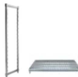
Spare Posts and Shelves