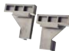
Corner Connectors #97690