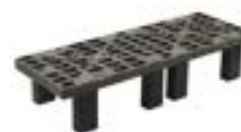
Heavy Duty Dunnage Racks #10810 #10812 #10814