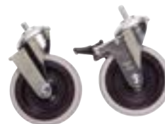
Castor Wheel Set #97692