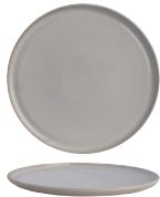
Round Flat Plate COUPE