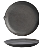
Round Plate COUPE / WITH SPOUT