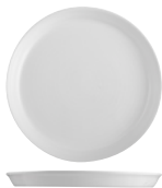
Round Plate TAPERED