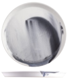
Round Plate TAPERED