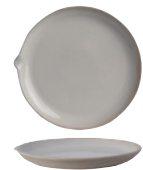
Round Plate COUPE / WITH SPOUT