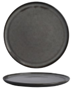
Round Flat Plate COUPE