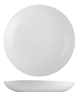
Round Bowl COUPE