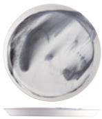
Round Plate TAPERED