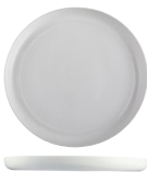
Round Plate STACKABLE