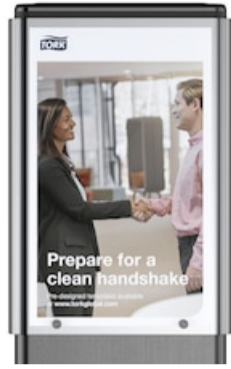
AD-A-Glance® for Tork Hygiene Stand 511054