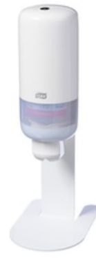
Tork Hygiene Stand Tabletop Small 511056