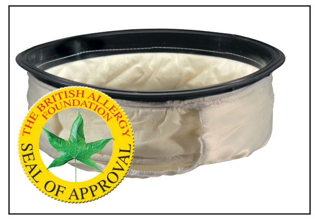
Optional HEPA Filter Upgrade