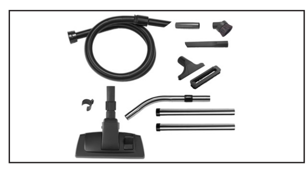
Comprehensive toolset with Stainless Steel Wands