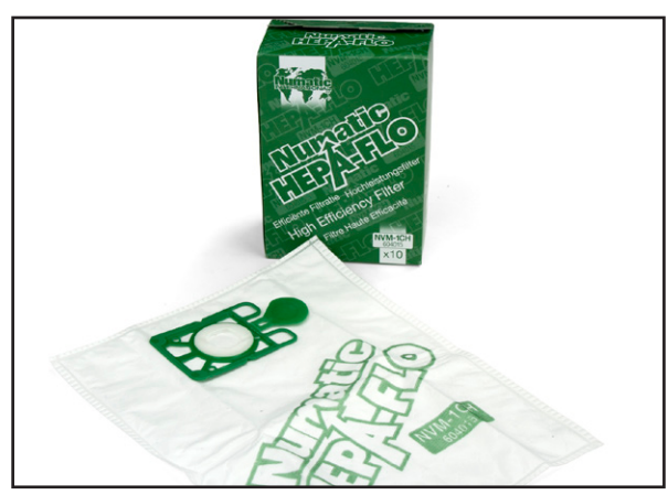
High Efficiency Hepa-flo Bags