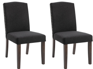
LETHBRIDGE DINING CHAIR SET OF 2 - CHARCOAL 49.5cm W x 61.5cm D x 98cm H