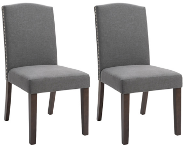
LETHBRIDGE DINING CHAIR SET OF 2 - LIGHT GREY 49.5cm W x 61.5cm D x 98cm H