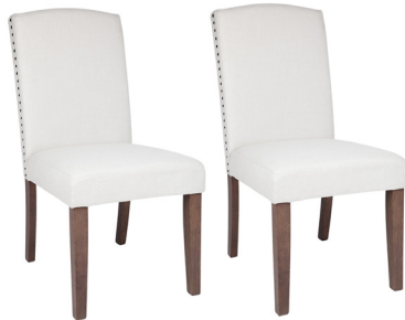
LETHBRIDGE DINING CHAIR SET OF 2 - NATURAL 49.5cm W x 61.5cm D x 98cm H