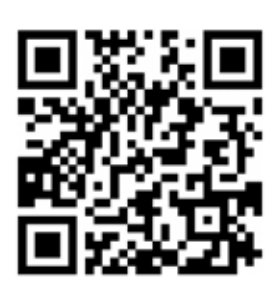
More information about Eclipse scan here