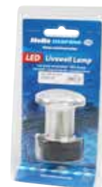
Packaging for aftermarket presentation