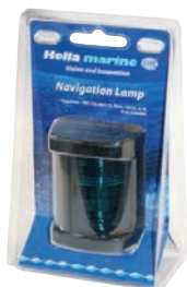
Packaging for aftermarket presentation