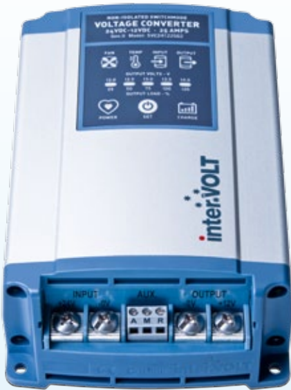
GEN II SVC – with terminal cover removed.