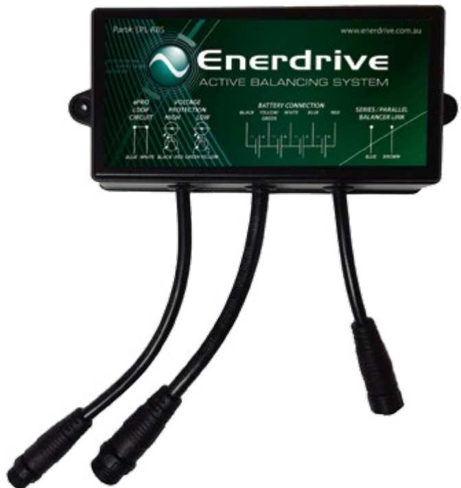
Main Battery Relay & Active Cell Balancer.