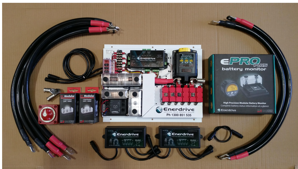
BMS Installation kit for a parallel system shown above

With Lithium, it is better and more accurate to work on the State of Charge Percentage (SOC%) to determine your remaining battery capacity.