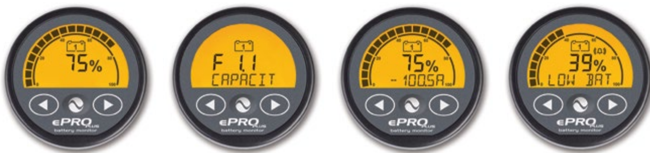
State of charge (%)