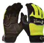
G-Force Synthetic Mechanics Glove GMY277