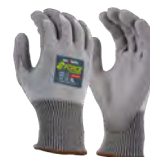
G-Force Silver Cut 5 Glove GDP138