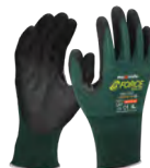
G-Force Ultra C3 Glove GCT177