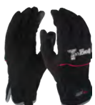
G-Force Synthetic Riggers Gloves GRS235