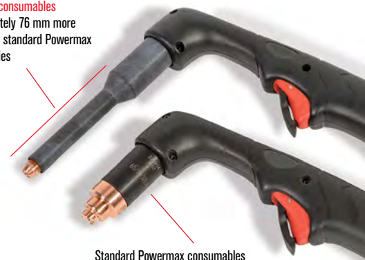
Standard Powermax consumables

HyAccess consumables Approximately 76 mm more reach than standard Powermax consumables