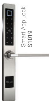
Smart App Lock S1019