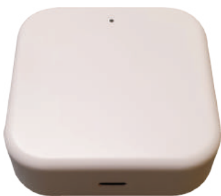
Wifi Hub / S651