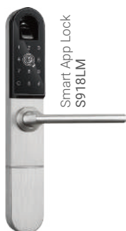
Smart App Lock S918LM