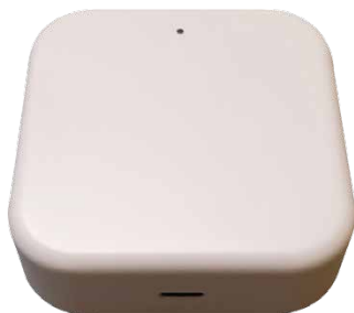
Wifi Hub / S651