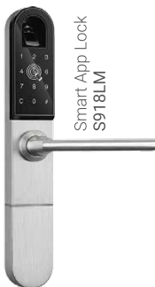
Smart App Lock / S918LM