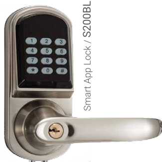
Smart App Lock / S200BL