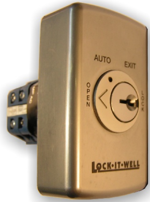
The Example shown is for a Auto Series Lockwood 6-pin inline mullion mount, with key removal in 4 positions Multi-Voltage switch.