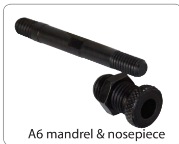
A6 mandrel & nosepiece