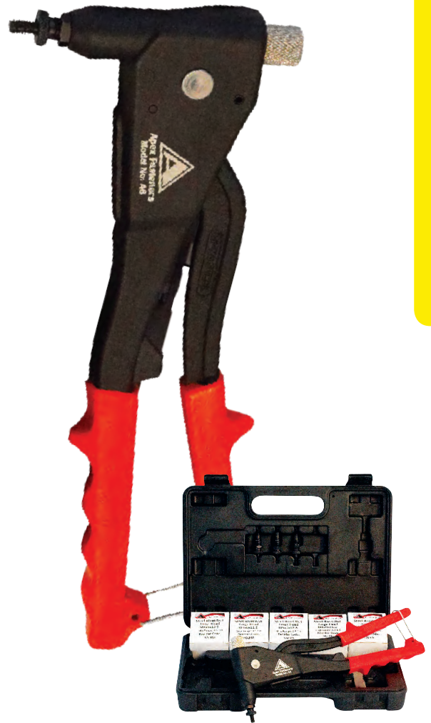
A6 Rivet Nut Kit