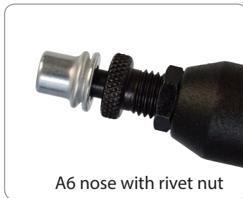
A6 nose with rivet nut