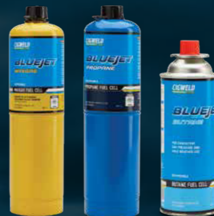
● MAXGAS ○ PROPANE ● BUTANE

STEP 2. Match application to corresponding fuel and a flame type