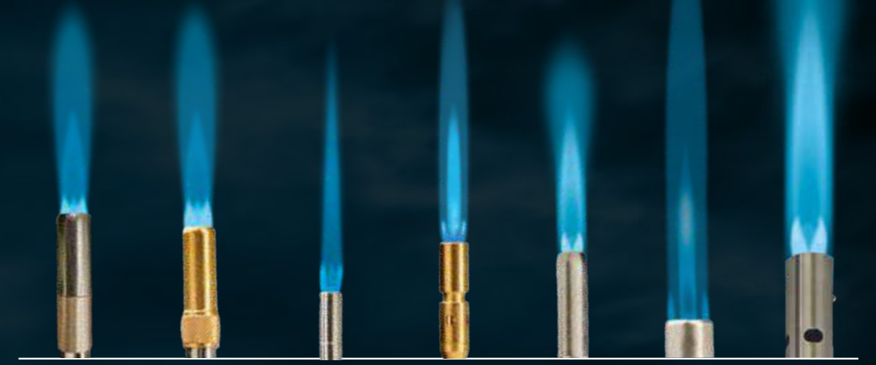
JET407 JET408 JET409 JET411 JET410 JET413 JET414